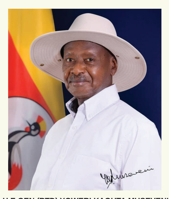
H.E GEN (RTD) YOWERI KAGUTA MUSEVENI President of the Republic of Uganda Commander-in-Chief of the Uganda Peoples' Defence Forces